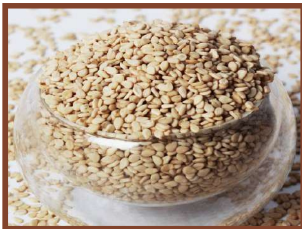
SESAME SEEDS (hulled)