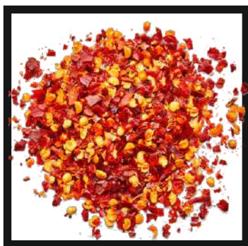
RED CHILLI FLAKES