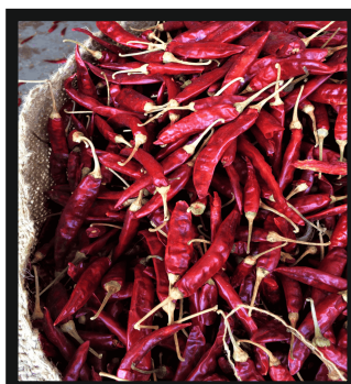
RED CHILLI S4/S10/SANNAM