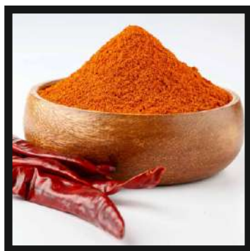
RED CHILLI POWDER