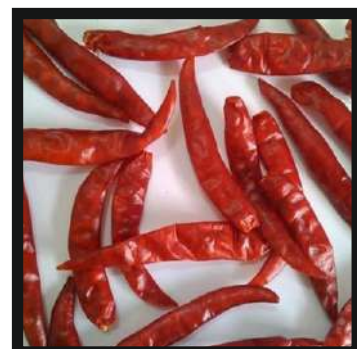
RED CHILLI S17/TEJA